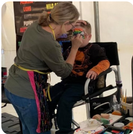
The kids love face painting in the GA Baptist Evangelism Tent at EXPO.